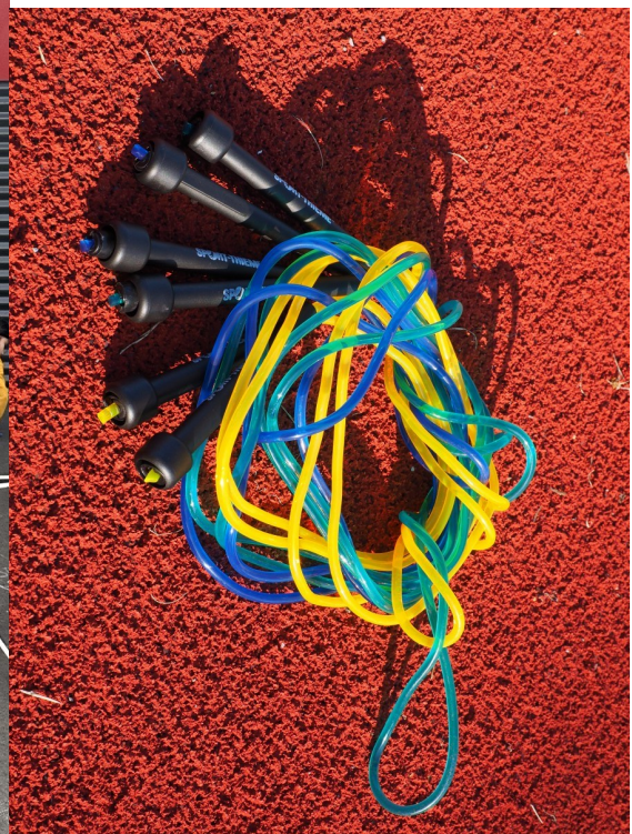
Jump rope - lunchtime program